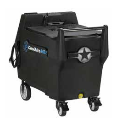
Transforms for secure and convenient transport or storage