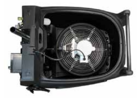
Lightweight atomizer/fan for easy one person set-up and break-down